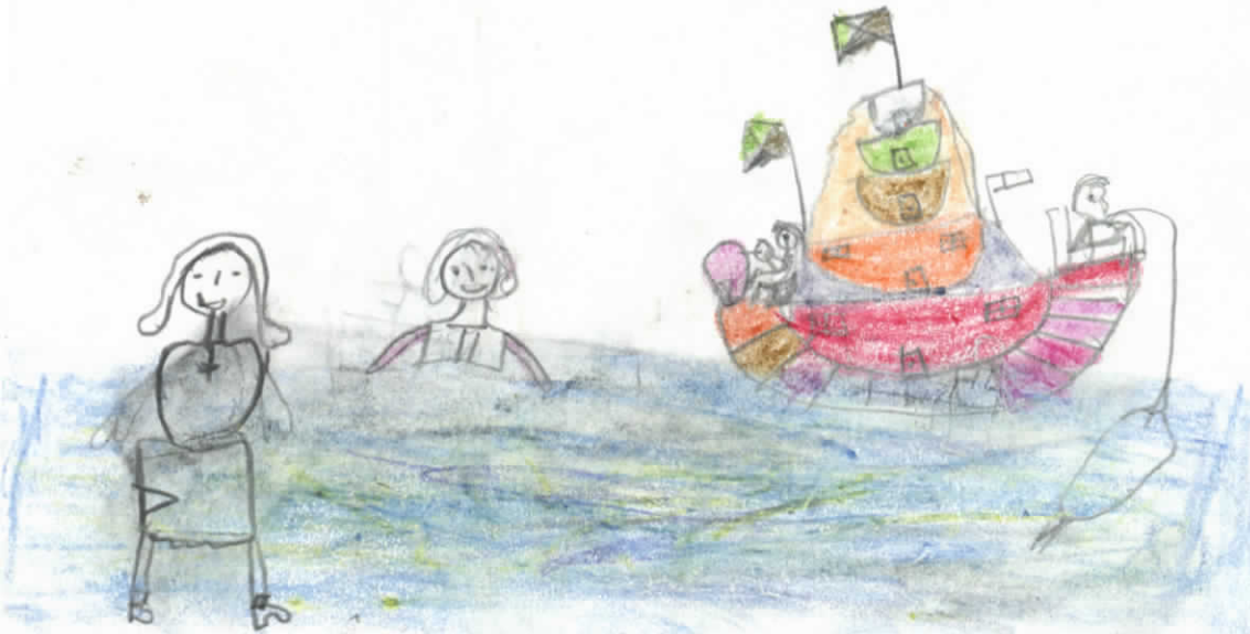
Draw a picture of some visitors who have come to Jamaica from far away.

I have just drawn some tourists on the beach